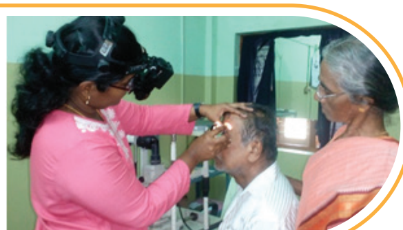
Monthly Diabetic Retinopathy screening at Chaithanya Nursing Home, North Parur