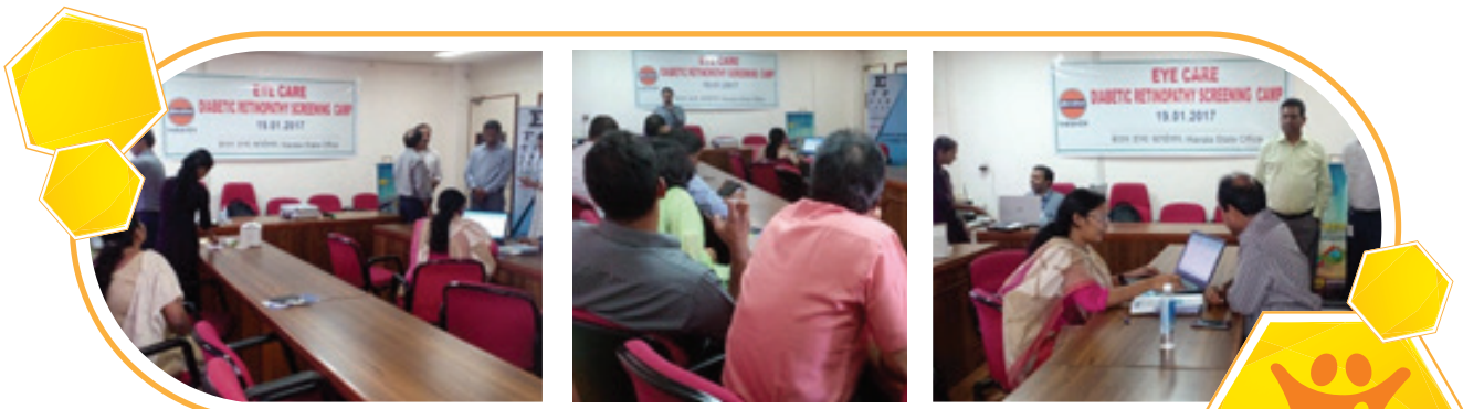
Eye Screening organized for the Indian Oil Corporation Staff