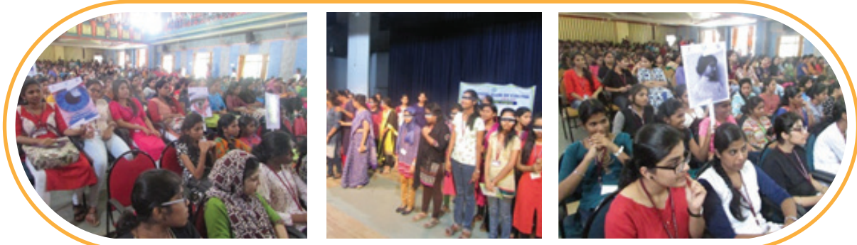
Eye Donation fortnight campaign organized at St. Teresa's College on the occasion of World Sight Day