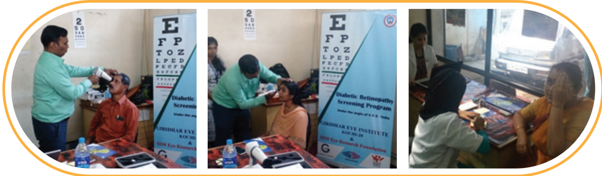
World Diabetic Day Screening Program arranged for the Idea Cellular Network staff.