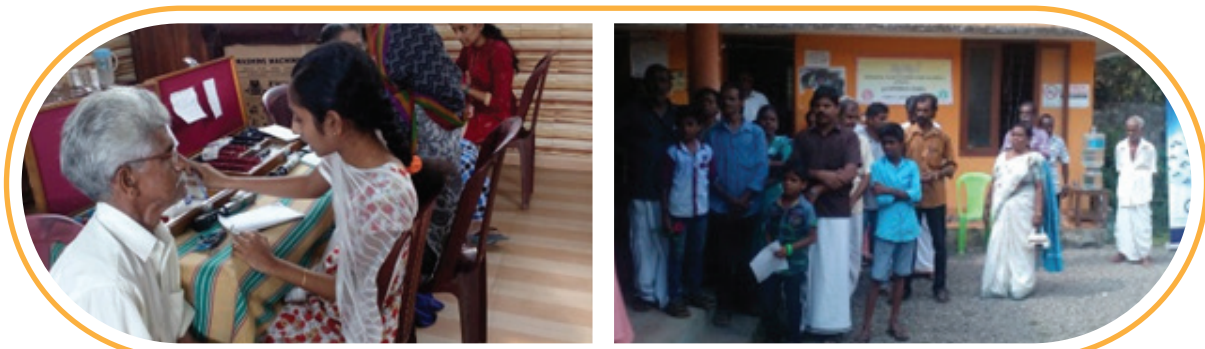
Eye Screening Camps held at various locations.