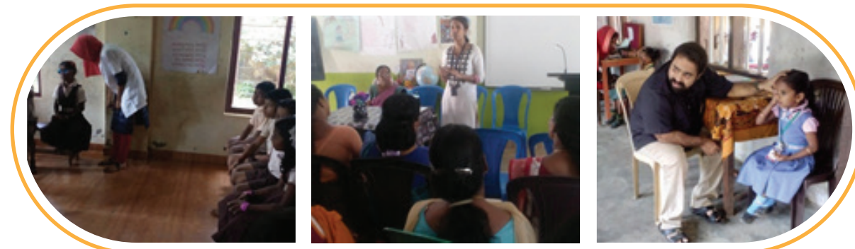
"Reach-Who-Teach" – Screening program organized for the school children through their teachers.