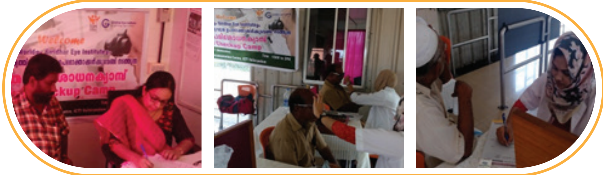
Eye Screening Program organized for the Truck Drivers at DP World, International Transshipment Container Terminal, Vallarpadam