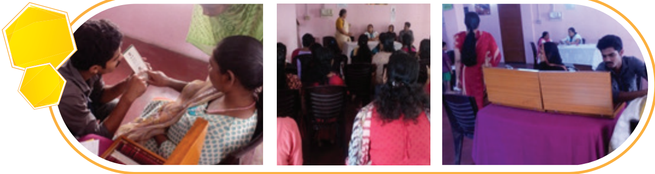
Screening program held for the inmates of Nirbhaya Centre (Kerala Govt. Project)